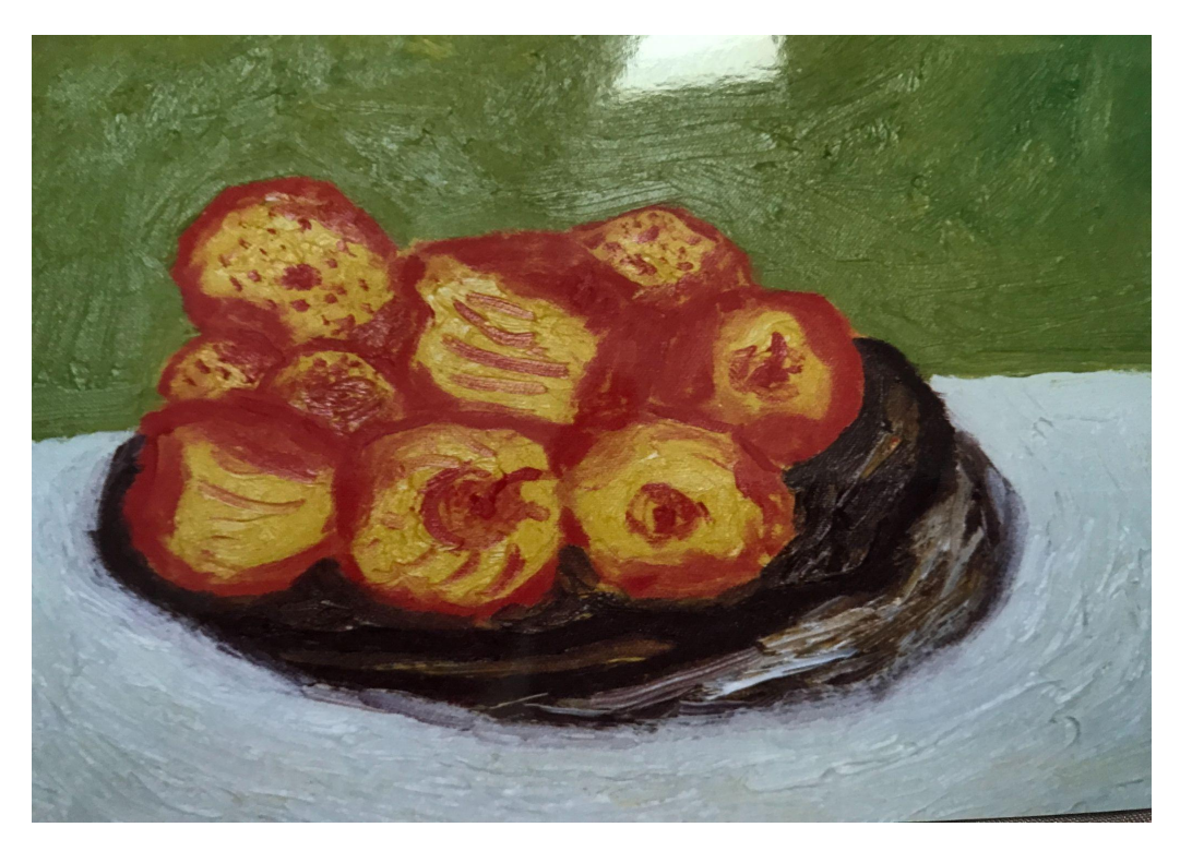
Organic fruit from the market

being friendly and respectful to your fellow human beings meeting at the marketplace, buying e.g. some organic fruit. Or contributing to a better life and future for a child. Or an animal, or taking care of your garden.